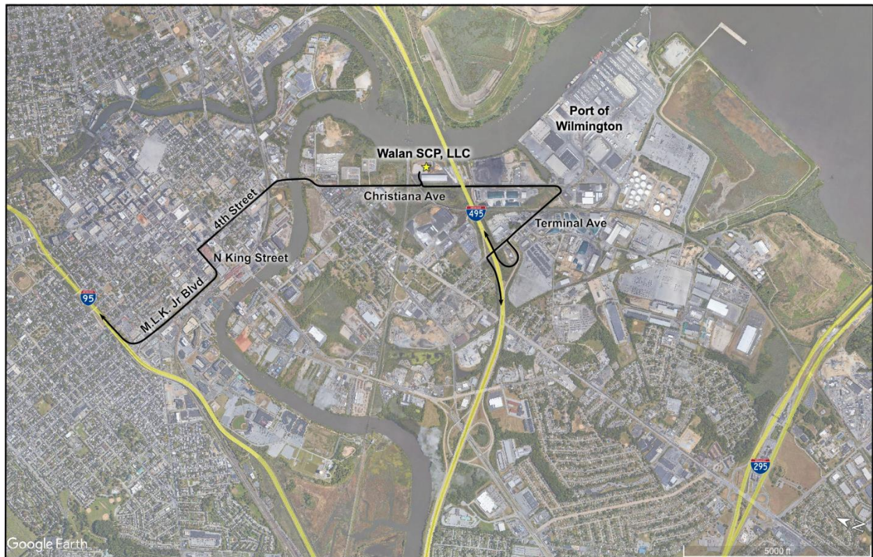
Truck route outbound from Walan SPC, LLC (avoids residential areas):