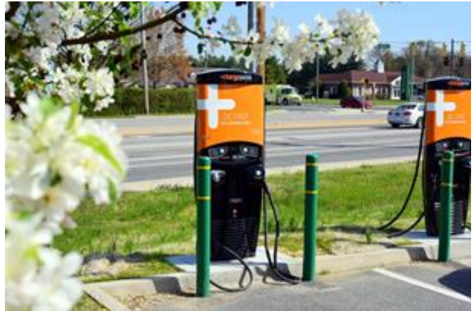
DC Fast Charging Stations at Royal Farms in Dover

For this subtask, the coordinator and co-coordinator are tasked with verifying alternative fueling stations throughout Delaware. Out of a list of 36 stations, 19 stations were verified this quarter. As part of this subtask, we also must take pictures of the alternative fueling station. This information will be posted on the U.S. Department of Energy's Alternative Fuel Data Center to help guide alt. fuel drivers to the stations. Some of the pictures that were taken during the site visits can be found to the right. We hope to complete the station verifications by the end of the summer.