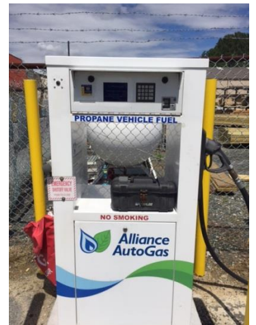
Propane Fueling Station in Rehoboth Beach