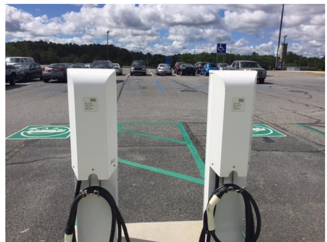
Level 2 Electric Vehicle Charging Stations at the Cape May-Lewes Ferry Terminal

We anticipate having more information on funding by the release of the Fall newsletter!