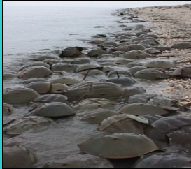
Horseshoe crabs spawning on a Delaware beach.