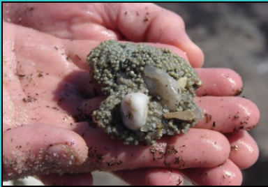
A horseshoe crab egg cluster. Successive waves of spawning crabs and wave action break up the clusters & bring eggs to the surface for migratory shorebirds to feast upon.