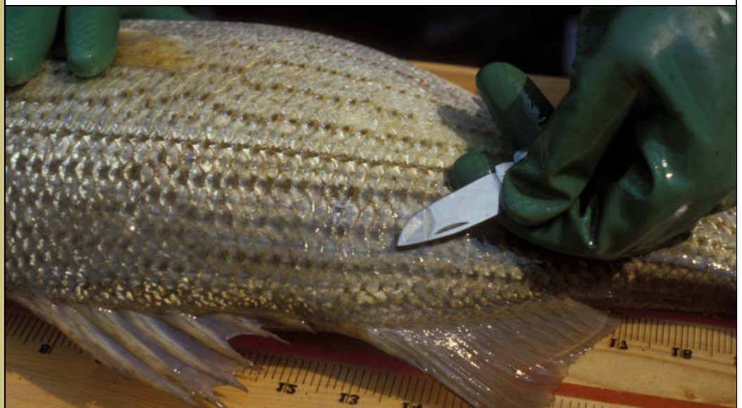
Using a pocket knife to remove scales from a striped bass.

Since the striped bass survey on the Delaware River is conducted during the spring spawning season, sex is easily determined. Often fish growth differs between males and females, as is the case with striped bass. Age and growth data are especially important when managing a fish species, like the striped bass, which migrates in and out of Delaware waters and is targeted by both recreational and commercial fishermen. Fish age and growth information is very important for quality management of Delaware's fish populations.