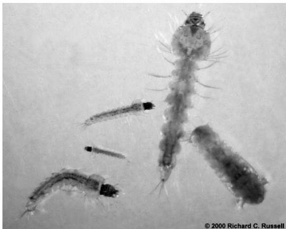
Larval instars —four larval instars (growth stages) are represented above along with the final stage, the pupa (on right).

Some mosquito species remain close to their breeding areas after emerging as adults while others, such as the saltmarsh mosquito, can fly up to 40 miles from their larval development areas.