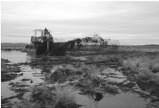
The amphibious rotary excavator is used to selectively create ponds and ditches in salt marshes for biological mosquito control. Broadcasting of spoil over the marsh surface as a thin slurry permits rapid re-growth of the original vegetation.

breeding sites and by providing predatory fish access to mosquito breeding areas. Marsh areas treated with OMWM can control mosquito larvae for 15 or more years. OMWM treated areas also provide new habitats for a variety of fish and wildlife species.