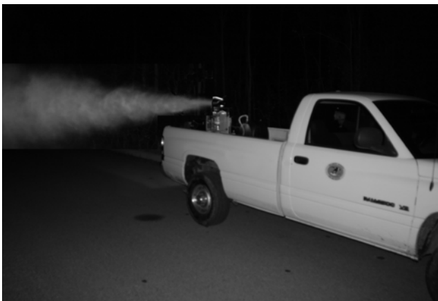
Adulticides are applied by a truck-mounted "fogger" in residential areas.

The adulticide compounds currently used in Delaware are naled and synthetic pyrethroids. These products are short-lived and must be reapplied for each adult mosquito infestation. Adulticiding is generally more costly than larviciding because adulticide applications are usually performed over larger areas.