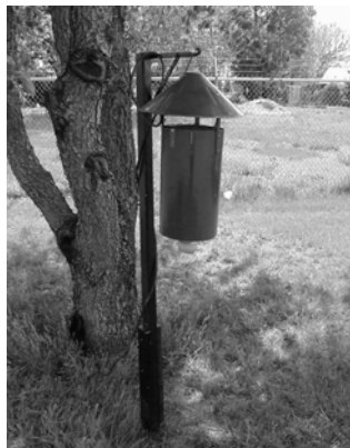
A “New Jersey” style light trap for monitoring adult mosquitoes. A light to attract the mosquitoes is under the funnel and a fan near the top directs mosquitoes into a collection jar at the bottom.

Encephalitis (EEE) and West Nile virus (WNV), both potentially deadly viruses which infect the brain of susceptible birds and mammals (e.g., horses and humans). Within the human population, the elderly are the most at risk. Mosquitoes contract both viruses by feeding on an infected wild bird and later transmit the virus while feeding on another animal.