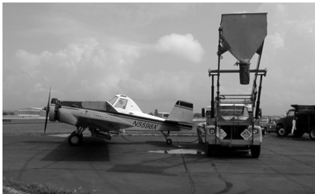
Fixed-wing aircraft are used to apply insecticides when vast expanses of marsh, woods, or developed areas need treatment.

wet woodlands, and roadside ditches. Larviciding is accomplished in small areas using hand-held or truck-mounted equipment. Larger tracts of land are treated using helicopters or airplanes. Methoprene, Bti, and temephos are currently the principle larvicides used by Mosquito Control. These products are environmentally compatible due to the rapid "breakdown" of the product.