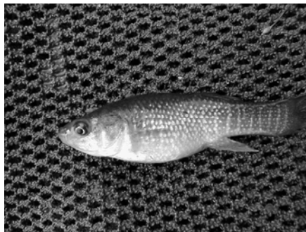
Saltmarsh killifish are natural predators of mosquito larvae. They are abundant in tidal wetlands, but access to mosquito breeding locations is often restricted.

Biological control is a natural form of pest control. The Mosquito Control Section enhances the biological control of larval mosquitoes by installing water management systems in mosquito breeding areas. Mosquito Control uses water management systems to manipulate water levels in order to interrupt mosquito life cycles before the larvae emerge as adults. Water management systems control mosquitoes by altering mosquito breeding sites so they are unsuitable for egg and larval development and/or by providing access for larvae-consuming fish to mosquito breeding sites. Mosquito fish ( Gambusia holbrooki ) readily consume mosquito larvae and can sometimes be stocked and established in areas that have low predatory fish populations. Biological control provides more permanent mosquito control than chemical insecticides, resulting in a substantial reduction in insecticide applications and costs. Water management projects are a part of the Mosquito Control Section's Integrated Pest Management (IPM) program. The IPM program utilizes a combination of mosquito control methods resulting in effective and efficient mosquito control operations.