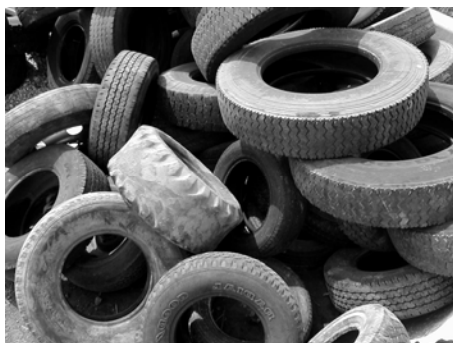
Man-made containers that hold water, such as discarded tires, create prime mosquito breeding habitat.

Individual homeowners can assist the Mosquito Control Section by eliminating mosquito breeding sites around the home which retain rainwater (e.g., clogged rain gutters, discarded tires, abandoned containers, and neglected bird baths). Concerns regarding persistent wet areas on property should be directed to appropriate drainage agencies.