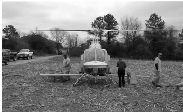
Helicopters are used to apply insecticides when small or localized areas must be treated. They are also a valuable tool for checking remote suspected mosquito breeding areas.

The Mosquito Control Section evaluates new mosquito control insecticides as they become available. New products must provide consistent control of mosquitoes, be environmentally compatible, non-hazardous to humans, and cost effective. If new products meet these requirements, they are considered for possible use by the Section in its battle against mosquitoes in Delaware.