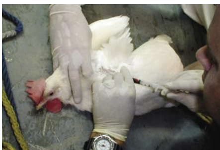
Blood samples from sentinel chickens at 22 monitoring stations around the state are tested weekly for mosquito-borne viruses.

nique for saltmarsh mosquito control is Open Marsh Water Management, which involves digging shallow ponds and small ditches in areas of irregularly-flooded coastal marsh where most saltmarsh mosquitoes are produced. This provides greater access to larval habitats for small native fish, primarily killifish, to consume mosquito larvae. OMWM also reverses some of the damage done to marshes that had been "parallel-grid-ditched" by the Civilian Conservation Corps in the 1930s, and restores or creates better habitat for waterbirds and other estuarine animals. Because OMWM provides mos-