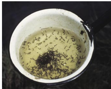
When larval densities, like that in the dipper, are found in widespread areas, quick control measures are needed to prevent future misery.

The Mosquito Control Section puts out information about where and when spraying will occur with radio announcements, by fax to many federal, state, county and municipal officials, on a toll-free phone hotline (800-338-8181), on DNREC's website, and via e-mails to people who have subscribed to the Mosquito Control listserv. (To sign up, go to the DNREC homepage, click on "E-mail List Subscription" under services and follow directions.)