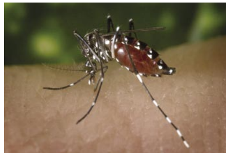
Over the past 20 years, the Asian tiger mosquito has become a major pest in Delaware's cities, towns and suburbs.

of mosquito developing from egg to larvae to pupae and finally emerging as an adult in almost all types of aquatic habitats in Delaware, whether natural or man-made. Not much water is needed: a tablespoon in an old soda can is enough to provide a home for numerous wrigglers.