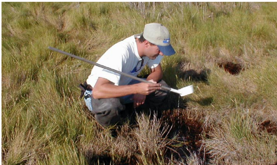
Vigilant surveillance is key to good mosquito control. Here a technician checks a Delaware saltmarsh – a perfect breeding ground for mosquitoes – for larval development.

spring, summer and fall as we treat various mosquito production problems in salt marshes, freshwater wetlands, and urban/suburban environments. The season doesn't end until the first killing freeze of the fall.