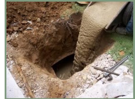
Underground Storage Tank Closure-in-Place

*Program does not include removal and/or replacement of hardscaping, landscaping, decking, etc. to perform UST closure activities.