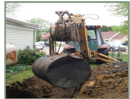
Underground Storage Tank Removal