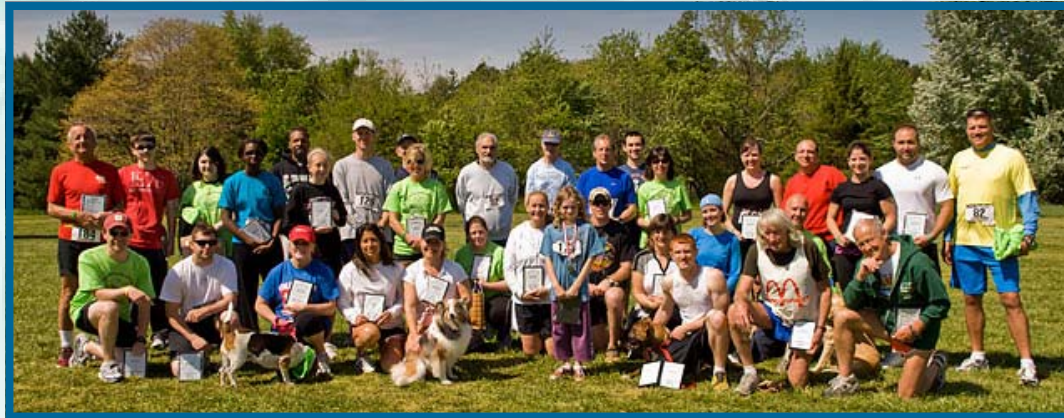
Congratulations to all the winners!!!!